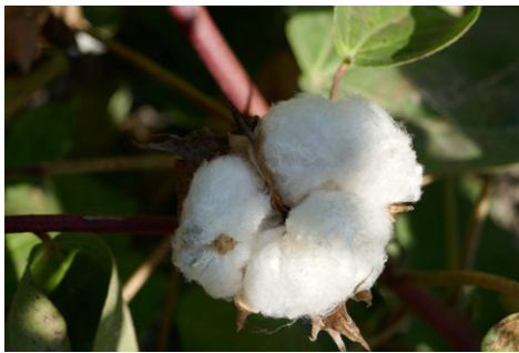
Figure 1 Cotton boll, Gossypium arboreum , Las Chapatales (Sevilla), Spain.