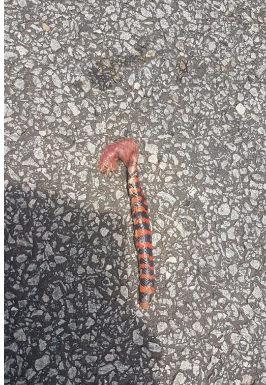
Figure 2. Section of Anilius scytale emerging from the bowels of the crushed B. atrox in Figure 1 above.