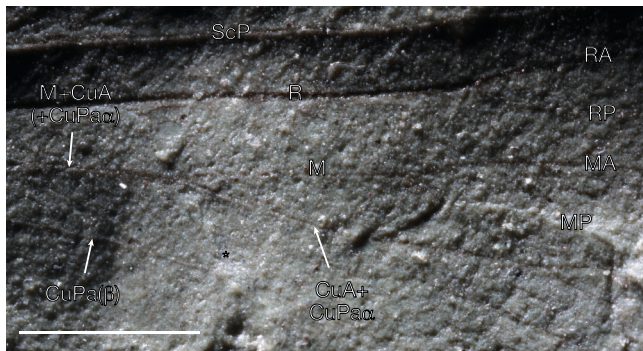
FIG. 2. — Parabintoniella papierae n. gen., n. sp., specimen 9122b (collection Louis Grauvogel at the 'Staatliches Museum für Naturkunde Stuttgart'), photograph of detail of medio-cubital area (location as shown with a white frame in Fig. 1C); the sign * indicates the area where the free basal portion of CuPa \alpha , present in the Orthoptera groundplan but absent in the Bintoniellidae, could be expected to occur. Scale bar: 2 mm.

With the aid of the systematic conventions posited above, the relationships between the species to which the new specimens belong can be discussed (Fig. 3). The occurrence of the character state 'in forewing, no distinct base of CuPa \alpha diverging from CuPa (and fusing with CuA or M+CuA)' (to be understood as 'beyond the wing base') qualifies an assignment to the Bintoniellidae. In other words, affinities with the Proshiellinae can be excluded. This condition is best observed in the specimen 9122 (Fig. 2).