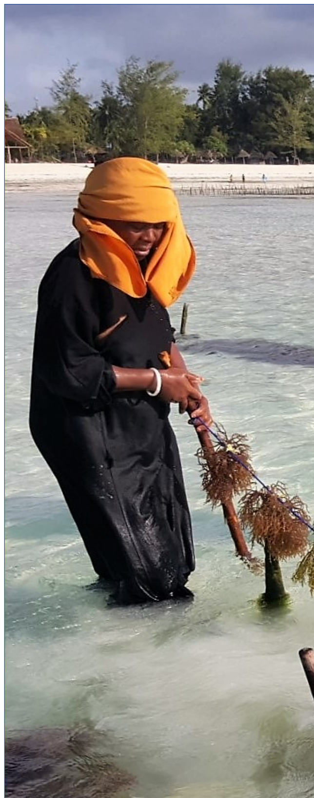
Tanzanian seaweed farmer deploying the next seaweed crop

As with any form of cultivation, the introduction and spread of seaweed pests and disease poses a major and increasing threat to production. Biosecurity helps minimise the risk of outbreaks and mitigates adverse impacts, thus protecting public health, ensuring the sustainability of the industry and safeguarding the environment. Biosecurity needs to be incorporated into government policies and regulations, as well as farm operational plans. In the context of the Progressive Management Pathway for Improving Aquaculture Biosecurity (PMP/AB), a new initiative of FAO and partners, biosecurity refers to the cost-effective management of risks posed by pathogenic agents to aquaculture through a strategic approach at enterprise, national and