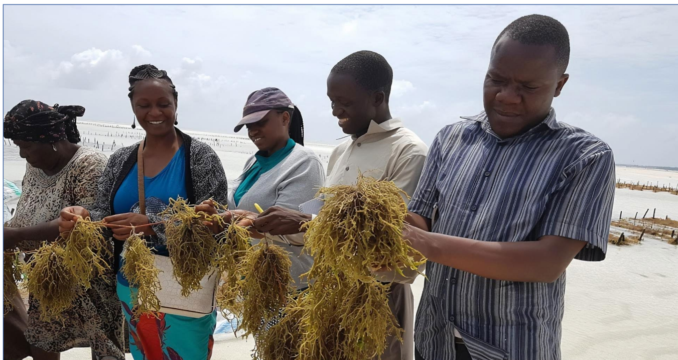
Early career researchers examine seaweed for pests and disease in Tanzania

Introduced, non-indigenous macroalgae can also alter ecosystem structure and function , by changing food webs, monopolising space, developing into ecosystem engineers, removing excessive quantities of nutrients and spreading far beyond their point of introduction, if the cultivars are allowed to escape from the farm. For example, in certain regions of the Philippines and Tanzania, only introduced farmed varieties of Kappaphycus spp and Euचेuma denticulatum can be found in the wild. The inter-breeding of farm 'escapees' with indigenous species may also lead to the impoverishment in the genetic resources of wild stocks, impacting on ecosystem resilience and reducing the potential for future breeding programmes.