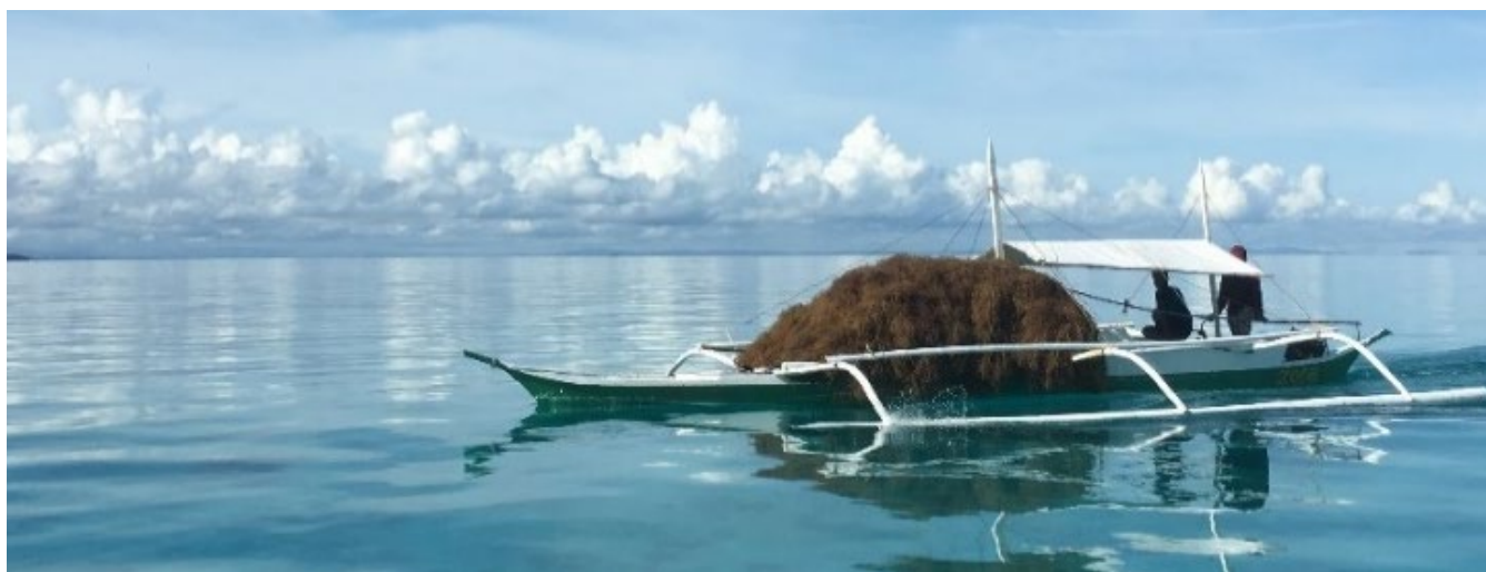
Philippine seaweed farmer with their newly harvested crop

Socio-economically, a pest or disease outbreak can have devastating economic consequences on farmers, families and their wider communities. The seaweed industry supports the livelihoods of approximately 6 million small scale farmers and processors, both women and men, in over 48 countries. Whilst high income countries are increasingly interested in cultivating seaweeds, particularly kelps, most seaweed production takes place in predominantly low- and middle- income countries, where it can make a significant contribution to incomes in impoverished coastal communities. Entire multi-generational families can be employed on seaweed farms and risk losing their livelihoods due to major pest and