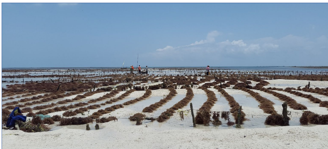
Seaweed farming in Tanzania

Such research networks would also contribute to policy improvements, alignment of policies with the One Health Aquaculture Approach, and aid countries in the implementation of national initiatives, such as the introduction of their PMP/AB-Seaweed.