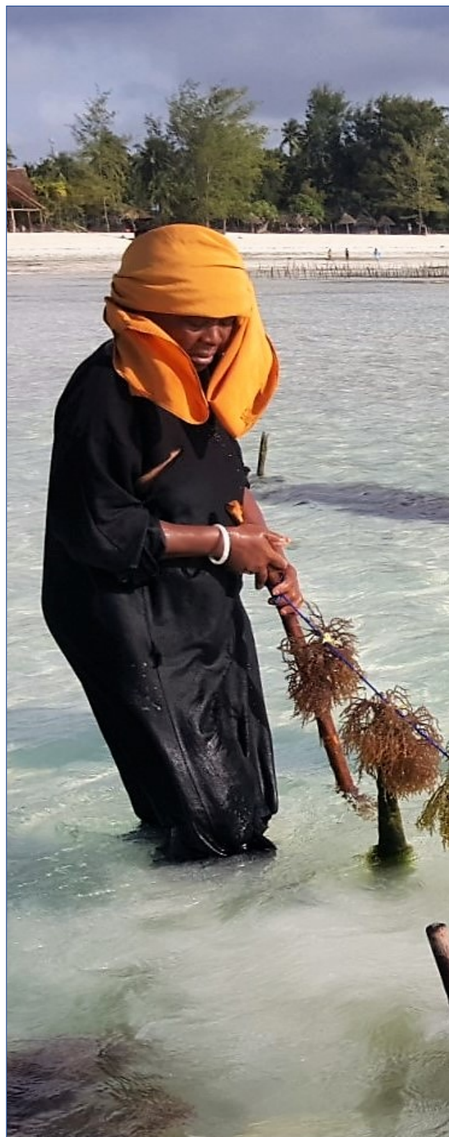
Tanzanian seaweed farmer deploying the next seaweed crop

As with any form of cultivation, the introduction and spread of seaweed pests and disease poses a major and increasing threat to production. Biosecurity helps minimise the risk of outbreaks and mitigates adverse impacts, thus protecting public health, ensuring the sustainability of the industry and safeguarding the environment. Biosecurity needs to be incorporated into government policies and regulations, as well as farm operational plans. In the context of the Progressive Management Pathway for Improving Aquaculture Biosecurity (PMP/AB), a new initiative of FAO and partners, biosecurity refers to the cost-effective management of risks posed by pathogenic agents to aquaculture through a strategic approach at enterprise, national and