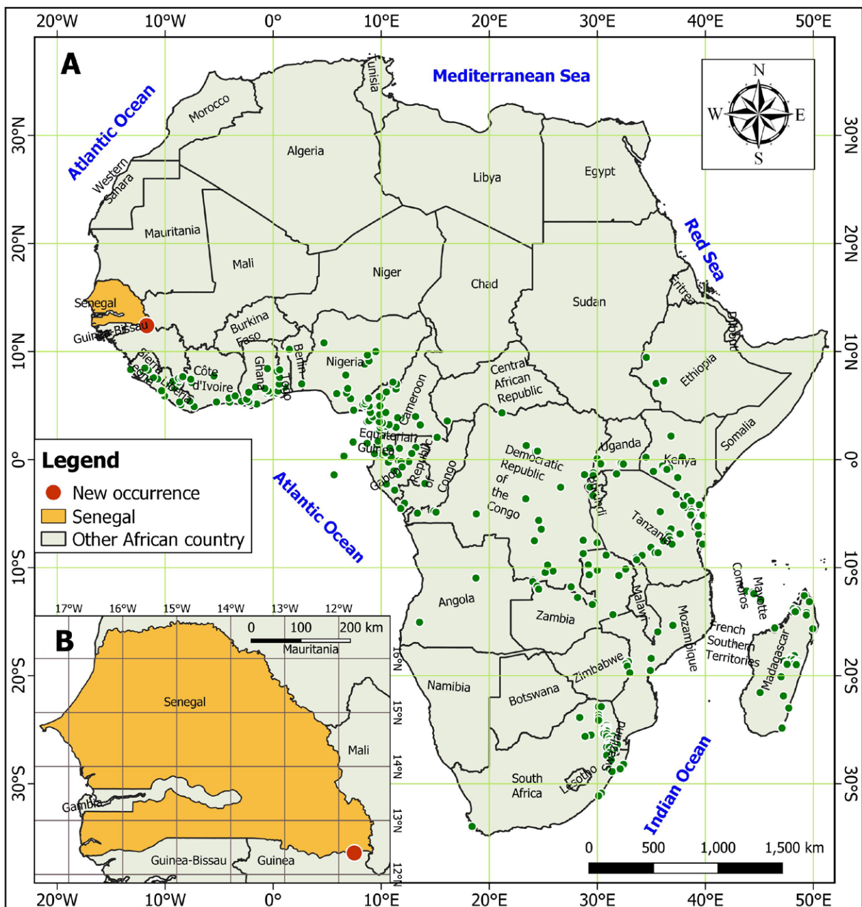
Figure 3. Distribution map of Dicranopteris linearis (Burm.f.) Underw. in Africa (A), including new record for Senegal (B).

slightly triangular in range, resistant pinnae more or less developed basiscopically, upper pinnae recurrent, opposite, sessile, glabrous, dark green, covered with a white powder at lower side. Rachis naked, winged at the top. Sori small, marginal, contiguous to scarious (Fig. 2B).