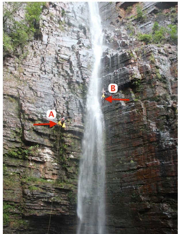
Figure 1. Two climbers collecting ferns along the cliff of the Dindéfelo Falls. A. Left side of waterfall. B. Right side of waterfall.

The rice fields and a palm grove were explored in their entirety due to their size. In the forest environment, we focused our prospections in large-vegetation cover where humidity is high, including ravines and banks of the water bodies; the gallery forest were prospected in their entirety, following the stream. Cliffs of waterfalls were prospected by two climbers and sampled over their entire height from top to bottom, stopping every 10 m in a vertical transect and including 5m