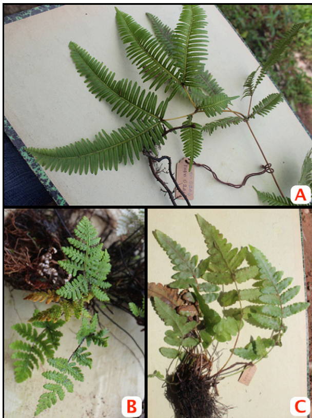
Figure 2. New records of ferns from Senegal. A. Dicranopteris linearis (Burm.F.) Underw. (PABM0264). B. Aleuritopteris farinosa (Forssk.) Fée (PABM0284). C. Blotiella currorii (Hook.) R.M. Tryon (PABM0263) collected in the cliff of the Dindefelo Falls.

Identification. Rhizome erect, with fronds in tufts of 3–15, narrow scales with elongated cells. Stipe 8 cm long, brown to almost black, shiny, bearing mainly at the base but almost over its entire length, narrow brown scales. Lamina deltoid outline, 15 cm long by 5, bipinnate–tripinnatifid. 5 pairs of pinnae, lanceolate to