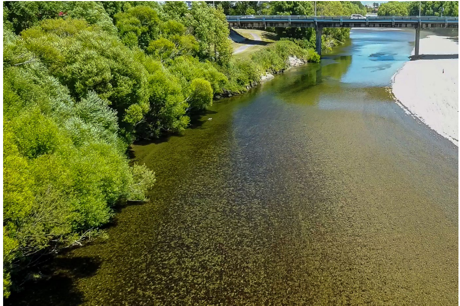
FIGURE 3 Image from an unmanned aerial vehicle of the Hutt River at Upper Hutt (New Zealand) showing a proliferation of Microcoleus autumnalis in January 2018. Image captured with a standard red-green-blue camera [Colour figure can be viewed at wileyonlinelibrary.com ]