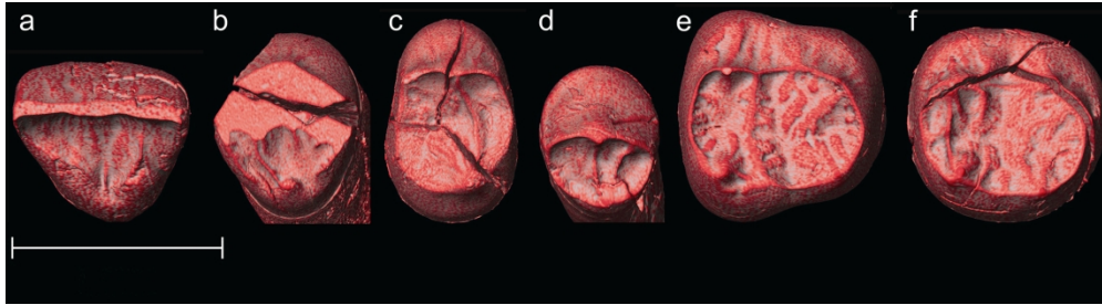
Figure 4. Three-dimensional topography at the enamel-dentine junction (EDJ) of the teeth from La Ferrassie, in occlusal view. (a) LF9 (URI1); (b) LF11 (ULC); (c) LF7 (URP4); (d) LF12 (LRP3); (e) LFG1 (LRM2); (f) LF10 (LRM3). Scale = 1cm.