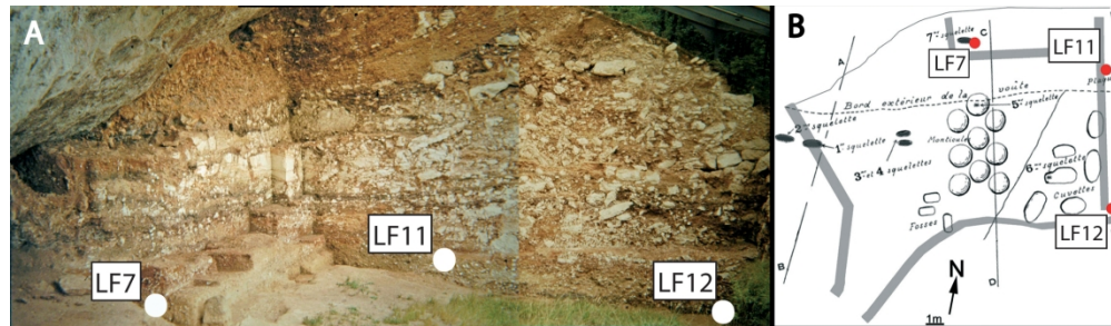
Figure 2. West-East and South-North sections in "Grand Abri" at La Ferrassie at the end of the 1968-1973 excavations (A) and map of the site showing the position of the isolated hominin remains (LF7, LF11 and LF12) relative to the Neandertal skeletons. The gray lines on the map show the position of the walls that were built after the end of the excavations to protect the site. The precise position of LF9 and LF10 within the site is unknown.