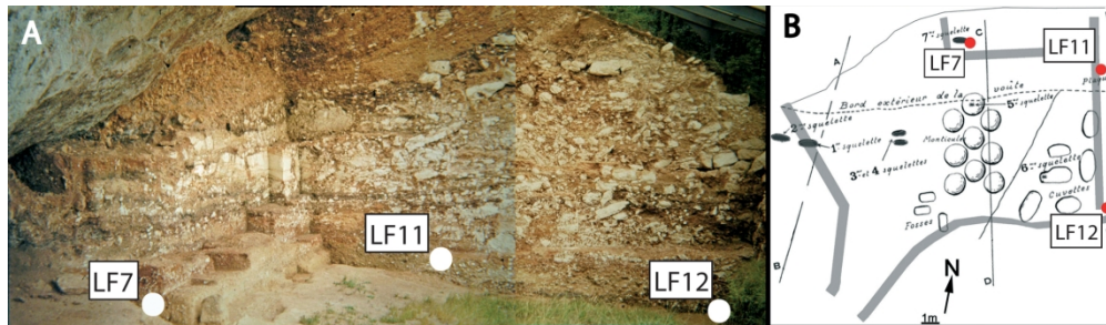
Figure 2. West-East and South-North sections in "Grand Abri" at La Ferrassie at the end of the 1968-1973 excavations (A) and map of the site showing the position of the isolated hominin remains (LF7, LF11 and LF12) relative to the Neandertal skeletons. The gray lines on the map show the position of the walls that were built after the end of the excavations to protect the site. The precise position of LF9 and LF10 within the site is unknown.