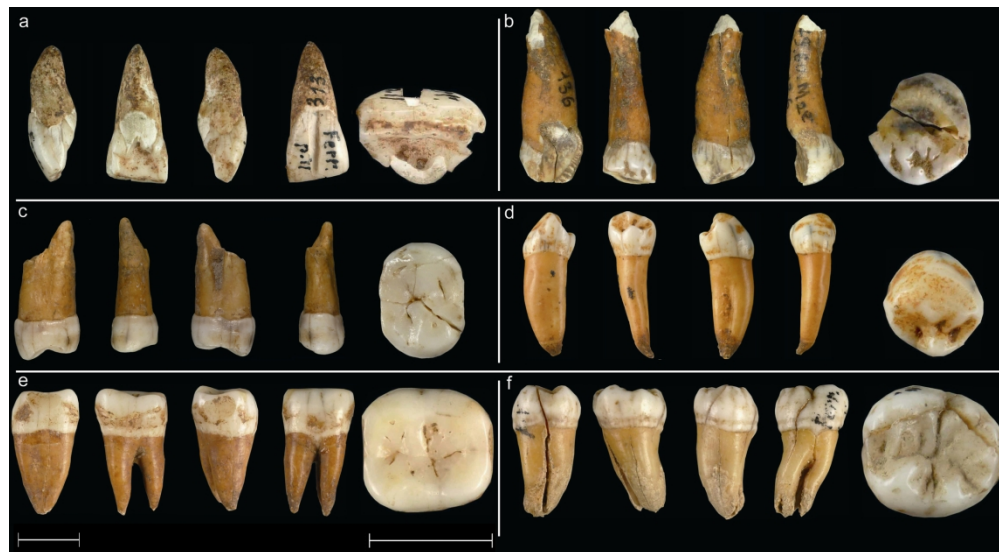
Figure 1. The new teeth from La Ferrassie in mesial, lingual, distal, buccal and occlusal views. (a) LF9 (URI1); (b) LF11 (ULC); (c) LF7 (URP4); (d) LF12 (LRP3); (e) LFG1 (LRM2); (f) LF10 (LRM3). Scales = 1cm.